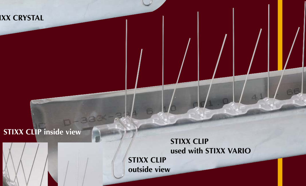
STIXX CLIP inside view