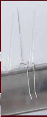
STIXX CLIP inside view